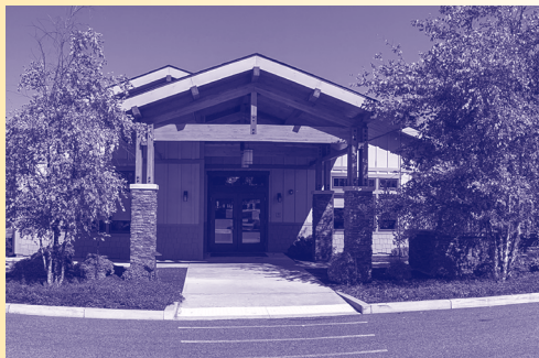
North Hospice House opened in 2014.