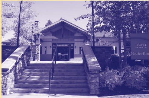
South Hospice House opened in 2007.

Not all of them were on the board during the planning stages and were quick to credit former board